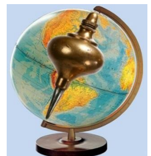
Logo of the International Plumb Bob Collectors Association IPBCA