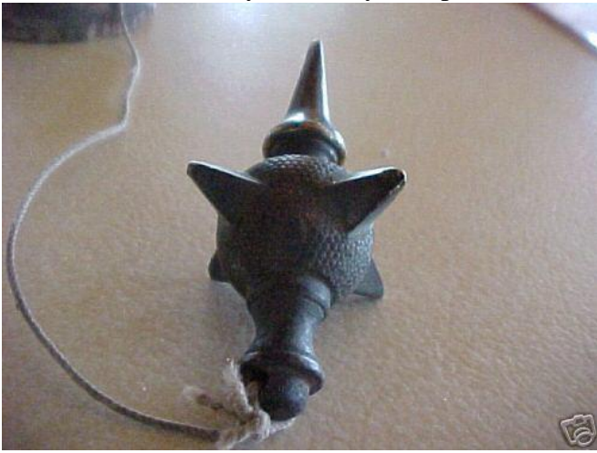
220045673069 snuff bottle with spoon