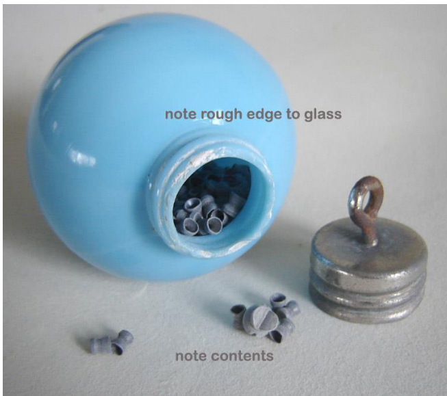
6134976029 Canada Victorian ©