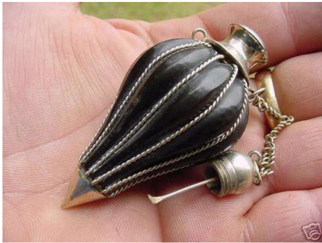
6267593930 plumb bob or nail