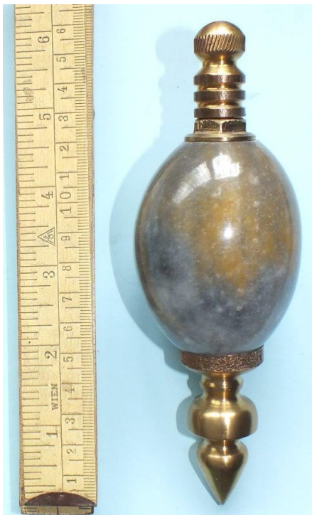
Another friend in Germany turns with his lathe big nice plumb bobs from brass (Fig. right) and brass with marble (Fig. left)